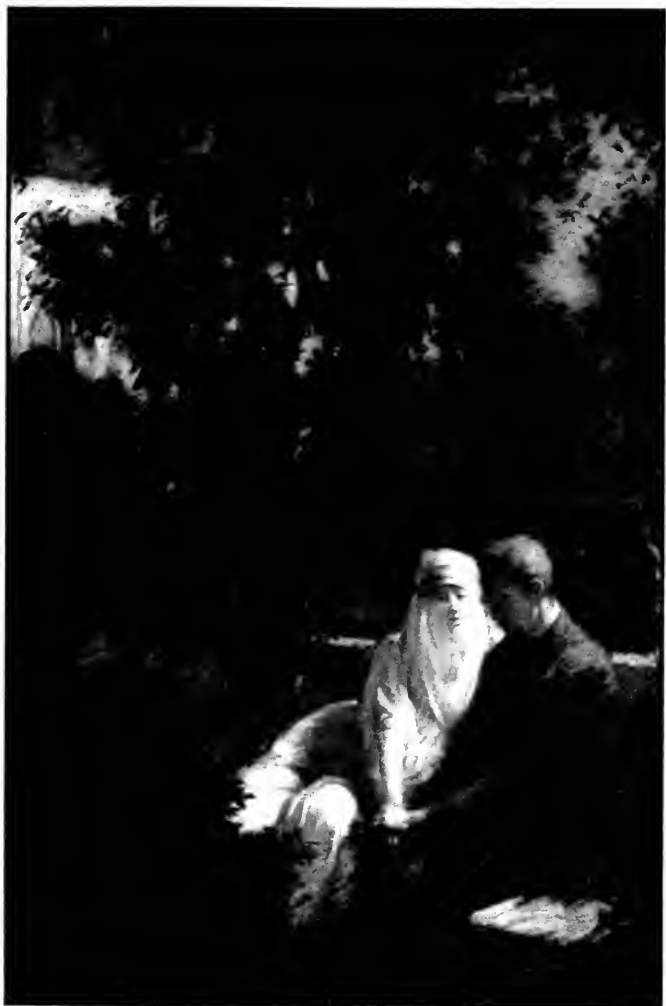
Her hair white, eyes as bright as the moon.